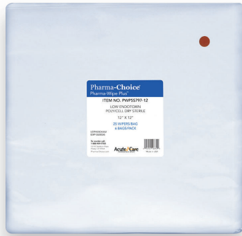
Pharma-Wipe 12" x 12" Sterile