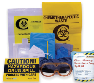
Chemo/HD Spill Kit