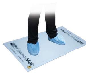
Pharma-Tacky Mat Refill *with frame