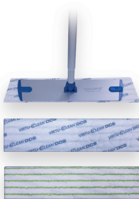
Sphergo Swivel & VCDCS Cleaning Pad