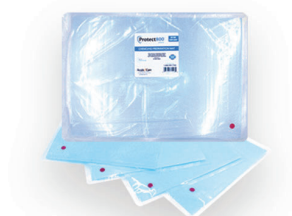
Pharma-Chemo Mats (Sterile)