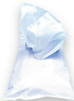
Pharma-Sat Plus Sterile