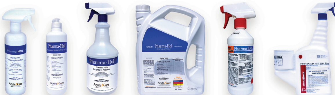
Pharma-Hol 70% IPA

*Sterile items are in red* Click on items to view spec sheet